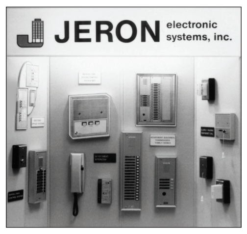
Jeron's Access and Security Stations from the 1970s

Assuring their customers of unparalleled reliability and safety, Jeron's Nurse Call systems are certified by Underwriter's Laboratories to the applicable UL 1069 standard for "Hospital Signaling and Nurse Call Equipment."