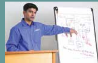
TECHNICAL CERTIFICATION CENTER