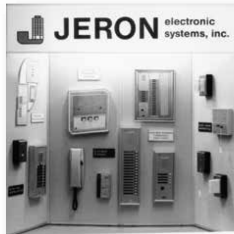
Jeron's Access and Security Stations from the 1970's

Assuring their customers of unparalleled reliability and safety, Provider's Nurse Call systems are certified by Underwriter's UL 1069 standard for "Hospital Signaling and Nurse Call Equipment."