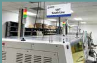
SURFACE MOUNT MANUFACTURING