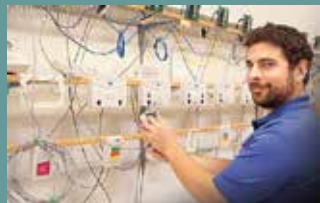
DESIGN AND TEST LAB