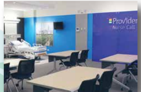
Provider ® TECHNOLOGY CENTER

Throughout the years, Jeron has maintained a family focus including a direct line of communication from customers directly to senior management, enabling a nimble product design and manufacturing process that meets the ever changing needs of facilities today.