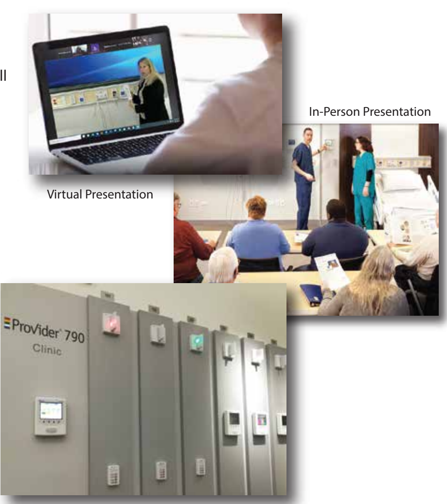
Full Clinic/ASC Operational System

Learn how Provider Nurse Call Systems can help raise satisfaction scores, call Jeron at 800.621.1903 or visit us at www.jeron.com